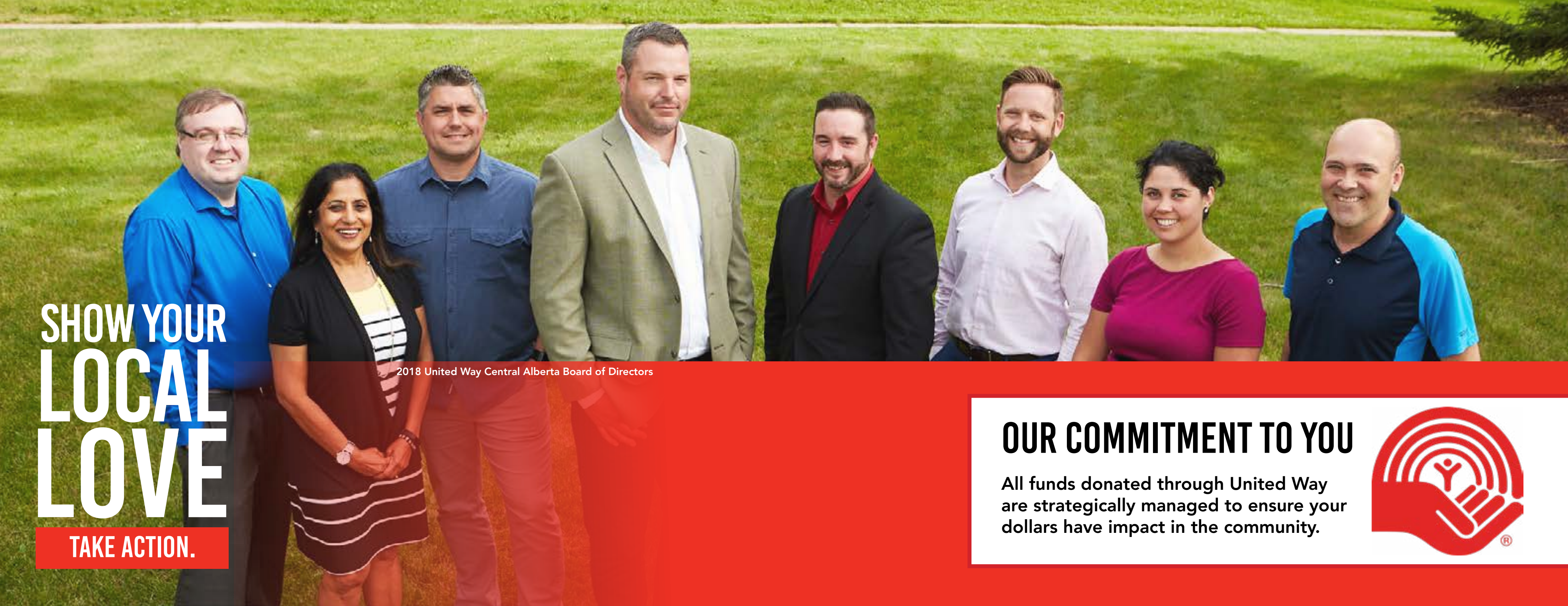
2018 United Way Central Alberta Board of Directors