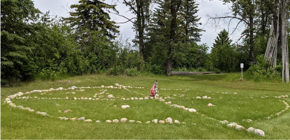
Medicine Wheel at Fort Normandeau